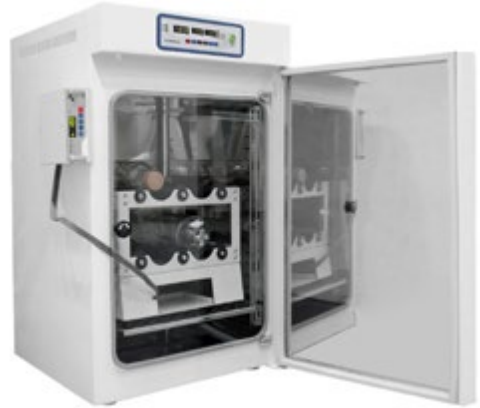
Can contain four Dia.100-120mm roller bottles.