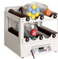
For remote roller, please reference Page 116

Controller can adjust speed without opening the door.